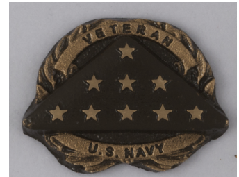
One-and-one-half inch Medallion