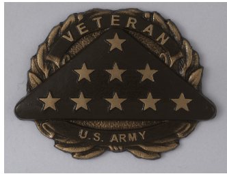
Three inch Medallion