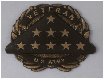
Five inch Medallion

Shown below are the three medallions with the maximum dimensions for height and length.